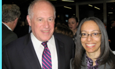
Pat Quinn Governor of Illinois